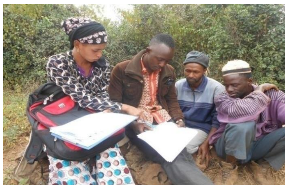
Photo 6: Investigation with the Kalikouré group leader. 03/10/2018