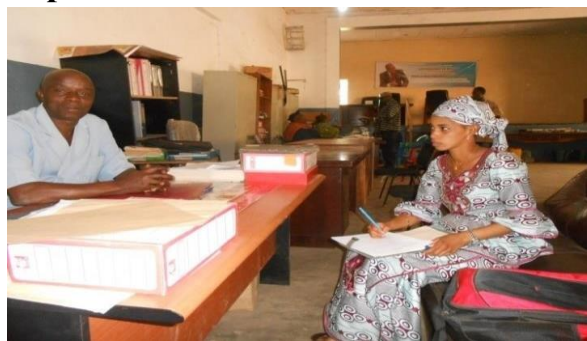
Photo 2: Investigation with the Secretary General of the urban commune of Mamou On